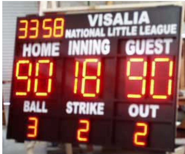
This photo is of the 96 inch wide version.

GM-BS-01CLK Baseball scoreboard with LED displays and wireless control. The frame is constructed from continuously welded aluminum box tubing which receives a high quality baked on powder coat finish. It has 17 inch tall LED digits for score and inning, and 9 inch tall LED digits for ball, strike and out. The clock counts down while displaying game statistics and can display the time of day when not in the game statistics mode. Display illumination may be adjusted to three levels. Scores up to 99, inning up to 19. LED displays last up to 160,000 hours. The included wireless controller means that there are no cables to worry about. Just plug it in and play. It uses less than 2 amperes of current at 120 volts AC. Size is 60 inches tall by 121 inches wide by 2 inches deep. Weight is approximately 120 pounds.